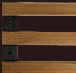
Pin classe 4 (uniquement 20S et 20S+)