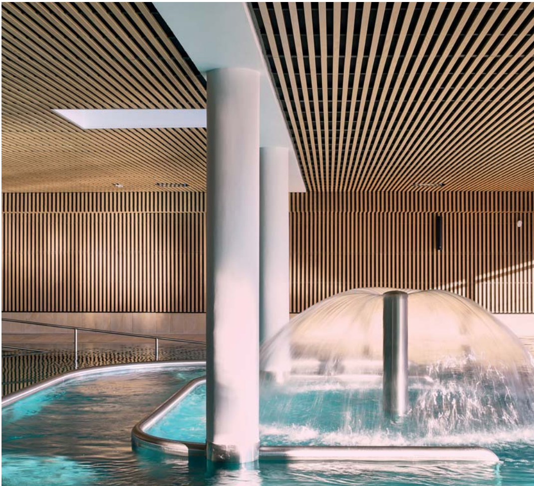
Mérignac aquatic stadium - Chabanne

In accordance with NF EN 14915 In accordance with DTU 36-2